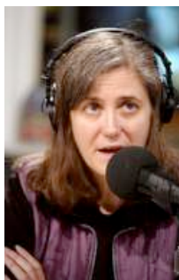
Amy Goodman